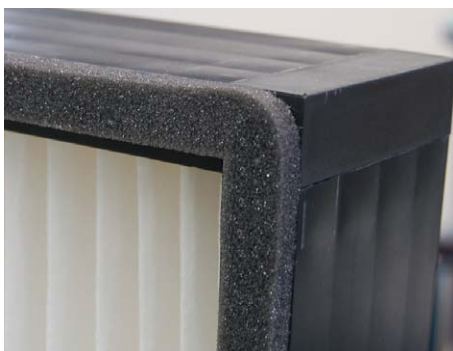
▼ 3. Optional: Tesamol gasket (19 x 10 mm)